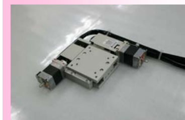
< CYA05A-S1W >